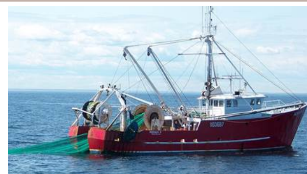
Ocean acidification poses a threat to the commercial fishing industry.

For more information about this and other climate change indicators, visit: https://oehha.ca.gov/climate-change/report/2018-report-indicators-climate-change-california