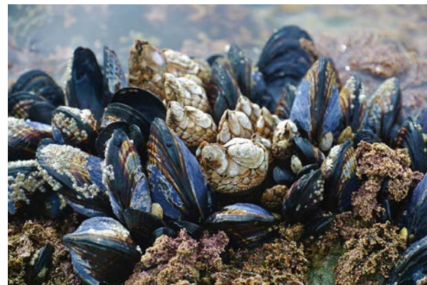
Ocean acidification lowers the amount of carbonate available to build shells.