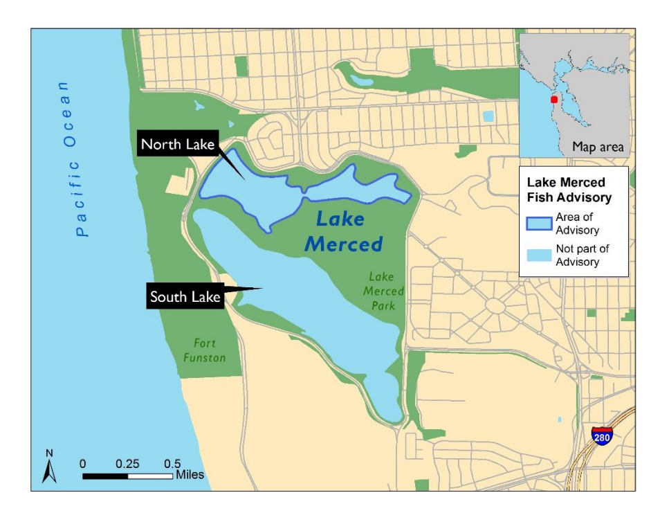
FIGURE 1. LOCATION OF LAKE MERCED

Lake Merced is a naturally formed, spring-fed lake system in San Francisco. Figure 1 shows a map of both the north and south lakes that comprise Lake Merced, and the surrounding designated parkland.<sup>1</sup> The lakes, owned by the San Francisco Public Utilities Commission and managed by the San Francisco Recreation and Parks Department, have been a water source for the city of San Francisco since the late 1860s.<sup>2</sup> Fish evaluated for this advisory were collected only from the north lake; samples were not collected from the south lake. Thus, this advisory applies only to the north lake, as shown in Figure 1. General advice for consuming fish from the south lake is also provided.